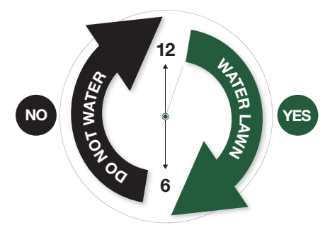
Water Your Lawn 12 pm - 6 pm